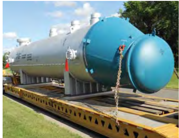
Hydrogen plant process gas boiler.

When a refinery calls us with a tall order...say sulfuric acid regeneration units with flue gas temperature up to 2200°F (1204°C) and each train producing 600 tons of product acid per day...we respond with designs answering the mechanical challenges of such massive thermal loads while maintaining cost-effectiveness.