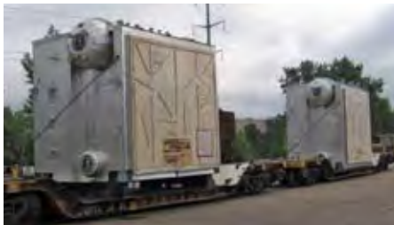
Two drum boilers for U.S.

Hamon Deltak invests in engineering talent because it makes a difference to our customers. We work hard to truly understand your technical needs up front as we believe there are no “standard” projects. All projects involve some degree of unusual technical challenges and our customers deserve to be speaking to experienced professionals...right from the beginning.